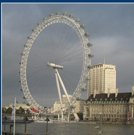
London Eye Degha Fongod '09