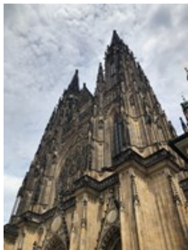
St. Vitus Cathedral