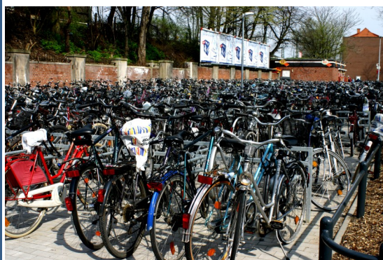
Münster Bahnhof Fahrräder