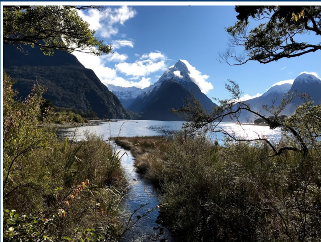
Fjordlands National Park, taken by Andrew Slear '21