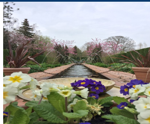
Roundhay Park