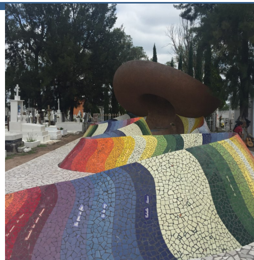
Tomb of José Alfredo Jiménez