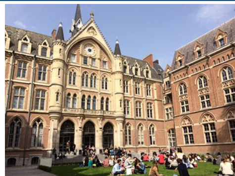
Lille Catholic University campus

Study Abroad 101 Info Sessions are held Wednesdays at 4pm @ the Oller Center Patio