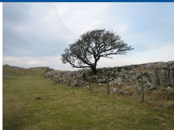
Yorkshire Dales