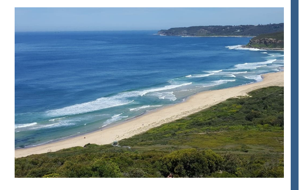
Glenrock Beach Area, Avery Lee '20