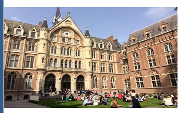
Faculté des Lettres & Sciences