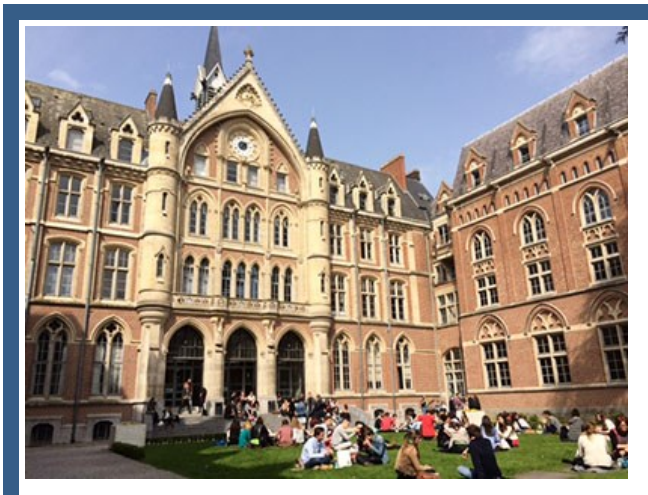
École des langues at Université Catholique de Lille