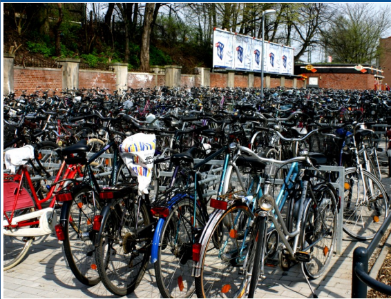
Münster Bahnhof Fahrraeder