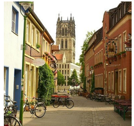
Münster City Center Germany.travel