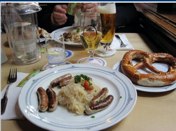
German Lunch