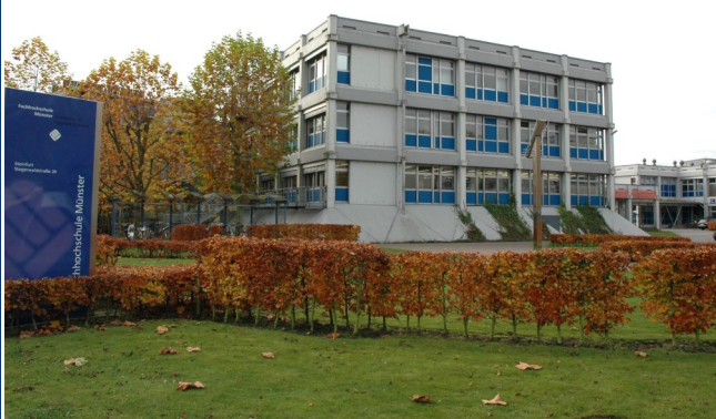
Münster University of Applied Sciences building