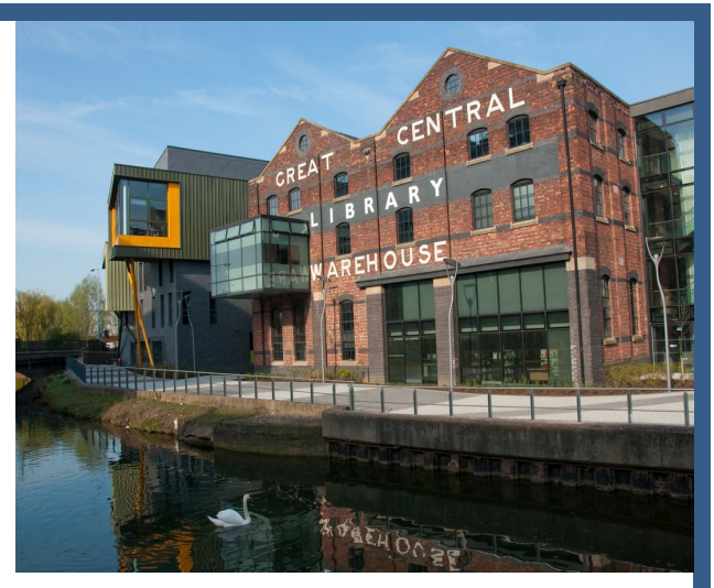
The University of Lincoln Library