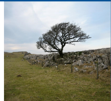
Yorkshire Dales

Study Abroad 101 Info Sessions are held Wednesdays at 4pm @ the Oller Center Patio