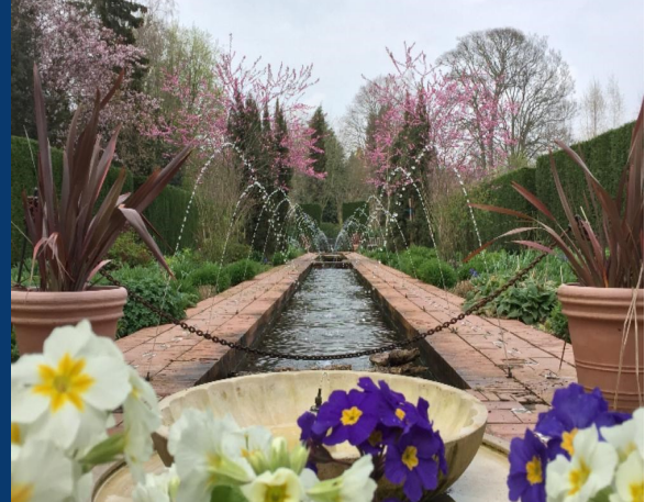
Roundhay Park in Leeds