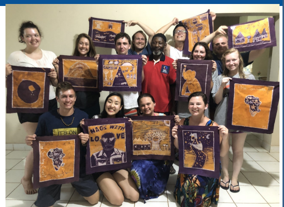
2019 Trip, Taken by Laurel Hwu '21

This course will explore several topics relating to women's rights, press freedom, economic developments, health care, and agricultural policy in the context of the Gambia. It includes a three week trip to the Gambia where exploration of these topics will continue as students will become immersed within the culture and society of the Gambia.