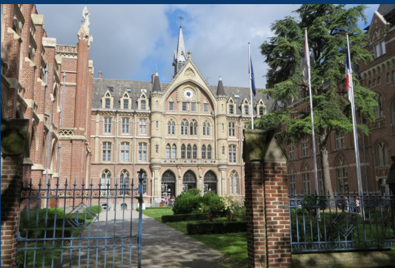
La Catho main building

Example Placements: Intern for a Member of British Parliament in the House of Commons (London); European Parliament (Brussels)