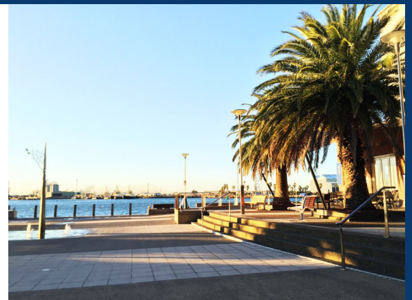
Newcastle Bay , Zane Clarke '17