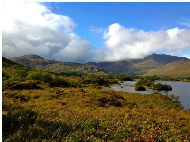
Killarney National Park