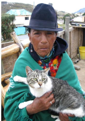
Mi Amigo