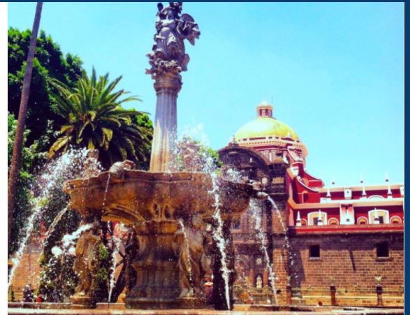
The Zócalo