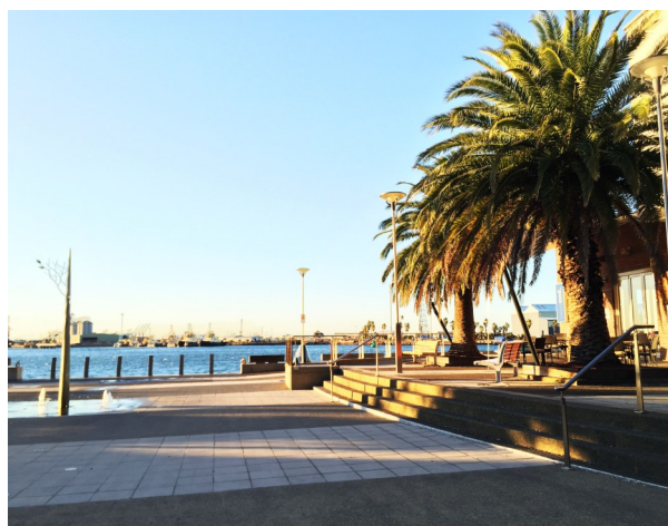
Newcastle Bay Zane Clarke '17