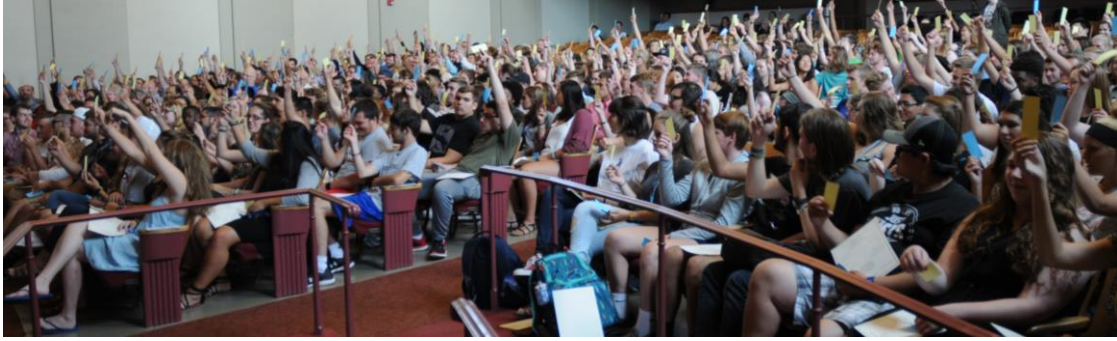
Figure 1. The students of the Class of 2021 vote during the 2017 Juniata College Opening Convocation.